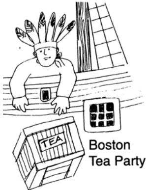
Boston Tea Party